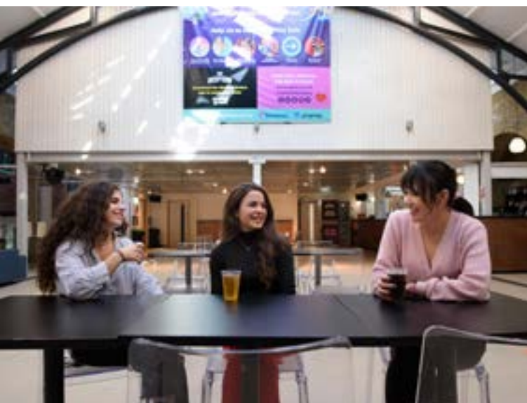
Medway Student Hub